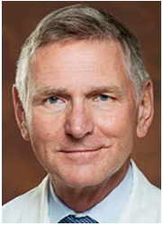
Professor of Neurosurgery, Rush University